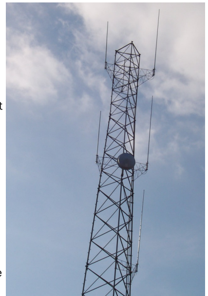
Shown here is the Centre County owned tower on Rattlesnake Mountain with the Big .43 Repeater antenna at the top.

Phase three of the project will be to evaluate the effectiveness of what has been done up to that point in terms of coverage and reliability. Phase four will be the installation of remote receiver sites if it is found to be necessary.