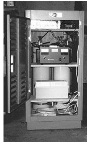
This is a view of the 146.640 / KB3CLZ repeater shortly after being placed into service by PARA.