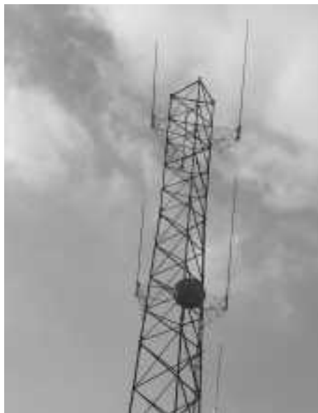
Shown here is a photo of the Centre County EMA tower on Rattlesnake Mountain which is home to PARA's .43 Repeater. This photo shows the antenna that failed and is in the process of being replaced.

At this time PARA is waiting for the ComPros tower crew to install the new antenna. The most recent communications from ComPros indicated they were planning to install the antenna the week of January 9th 2012. We have instructed the tower crew to arrange the antenna elements such that a cardioid radiation pattern is created. The intended coverage area sweeps from Bellefonte/State College to the east, south to Altoona and Philipsburg and turning west to Clearfield and Treasure Lake. The "sweet spot" in the coverage area is intended to be the Philipsburg area.