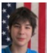
The Story of Derrick KB3YJR Page 6