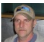
New PARA Officers for 2012 Page 4